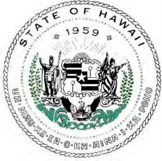
Exhibit 2: Offeror's Library Instructions RFP-ERP-2020